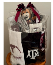
Aggie Dad Basket - $150 Value