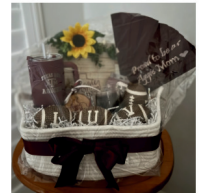
Aggie Mom Basket - $150 Value